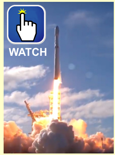
Falcon Heavy lift off with a Tesla Roadster payload on board

Achieving a game changing goal like colonizing Mars requires creative thinking, new technologies and incremental project successes. Recognizing that delivering large payloads from cost effective re-usable rockets would be needed, SpaceX did just that, deploying a Tesla car in outer space and landing the 2 booster stages back on earth.