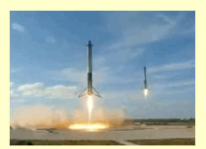
Boosters 1 & 2 make a flawless landing on return to earth Feb 6, 2018